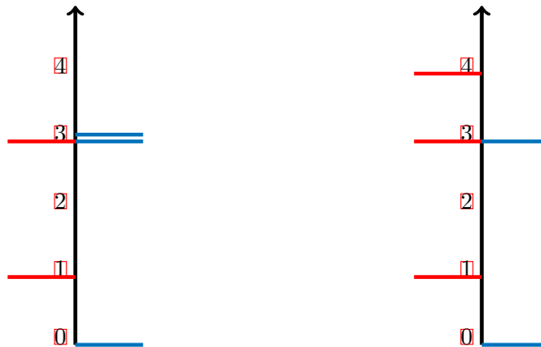
FIGURE 2. A demonstration of the involution between the monomials (u^1z)(u^3z)(u^0vz)(u^3vz)^2 on the left and (u^1z)(u^3z)(u^4z)(u^0vz)(u^3vz) on the right