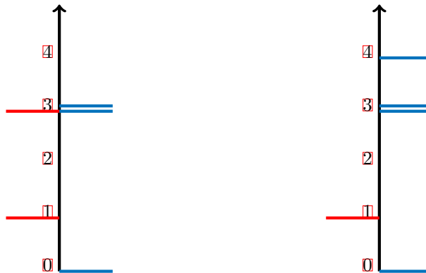
FIGURE 3. A demonstration of the involution between the monomials (v^1z)(v^3z)(uv^0z)(uv^3z)^2 on the left and (v^1z)(uv^0z)(uv^3z)(v^3z)(v^4z) on the right.